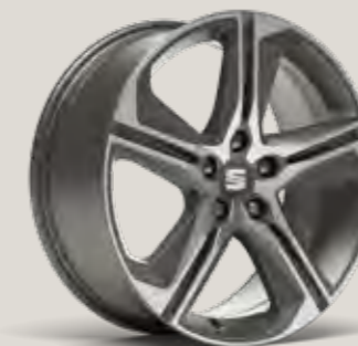
PERFORMANCE 18" 30/9 MACHINED COSMO GREY ALLOY WHEELS FR