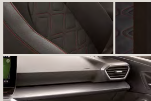
NAPPA LEATHER BLACK