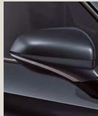
MAGNETIC TECH R St Xc FR