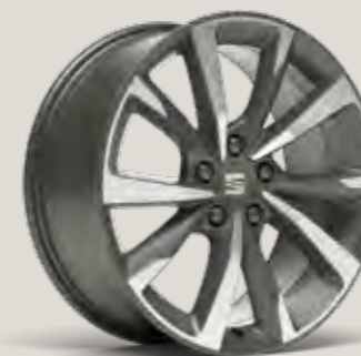
PERFORMANCE 18" MACHINED COSMO GREY ALLOY WHEELS FR