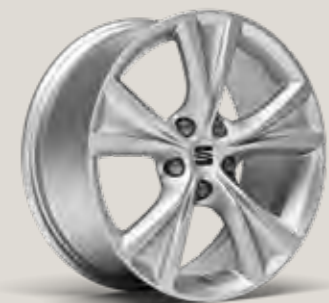
DYNAMIC 17" ALLOY WHEELS FR